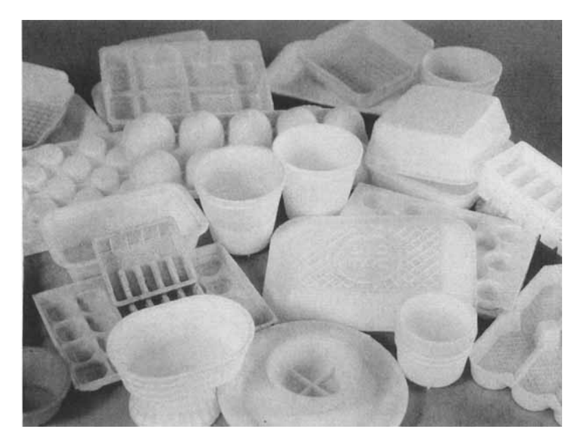
FIG. 2. Some examples of foamed starch-based trays.

strain. Humidity, pH, and aeration were controlled. The starting composition was 20% starter compost and 80% mixed bio waste with a C/N ratio of ~25:1. The maximum temperature in the composting cycle was between 65 and 70°C.